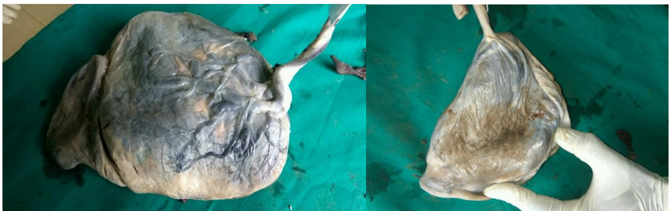
Fig 3: velamentous insertion