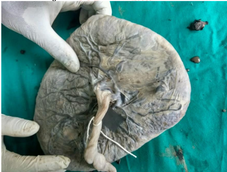
Fig 3: marginal insertion of umbilical cord