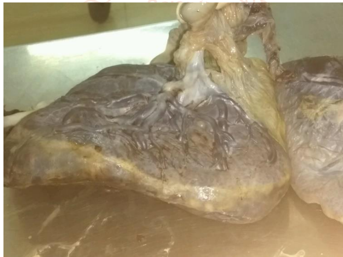
Graph 1: comparison with other studies