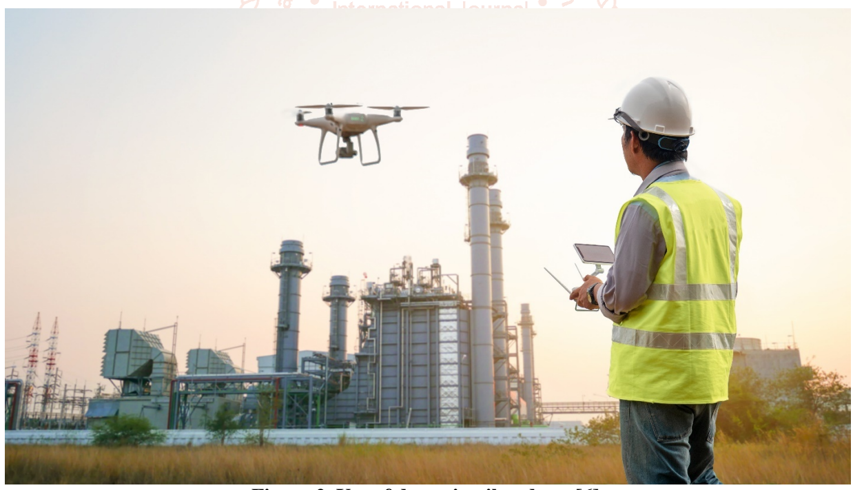
Figure 2 Use of drone in oil and gas [6].