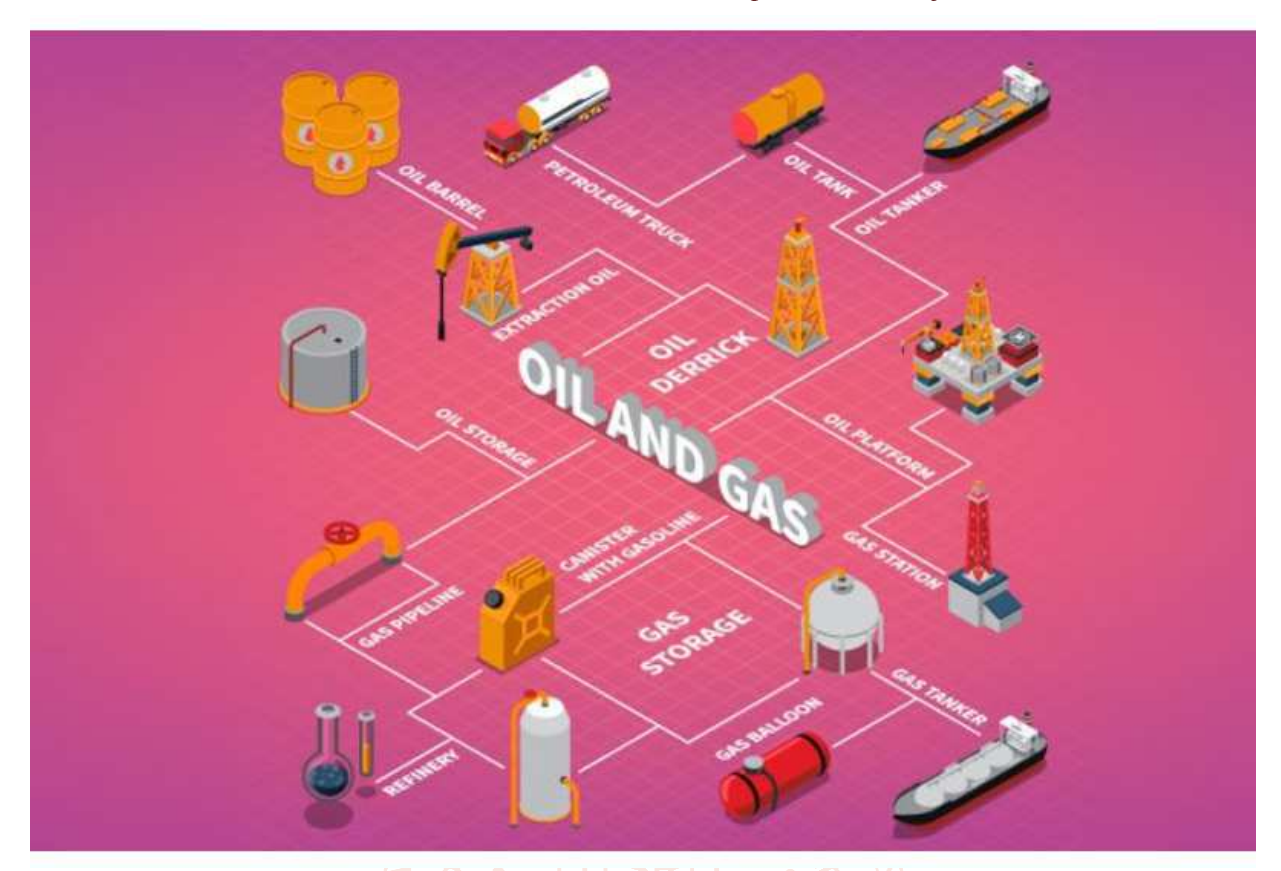
Figure 1 Representation of the oil and gas [1].