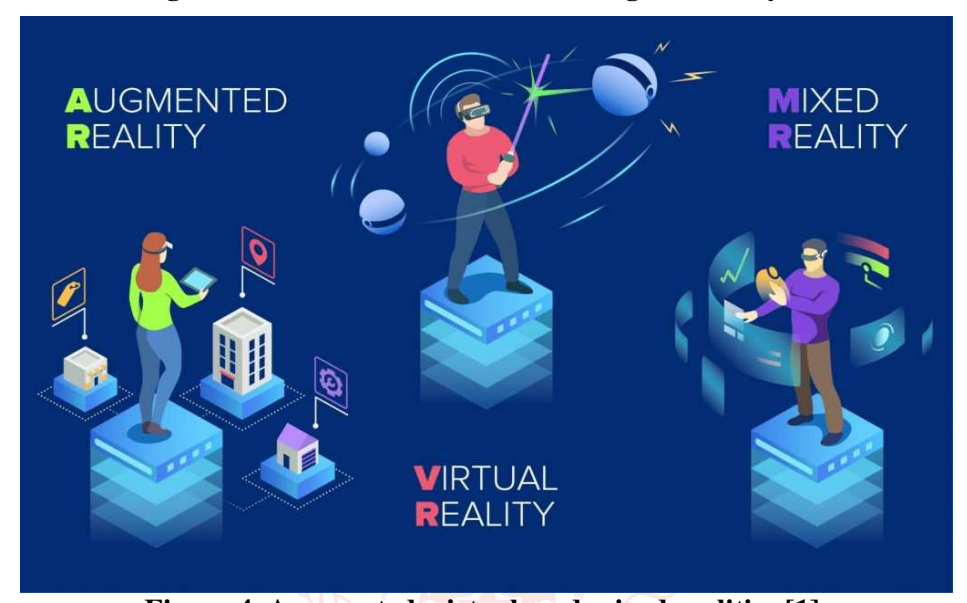
Figure 4 Augmented, virtual, and mixed realities [1].