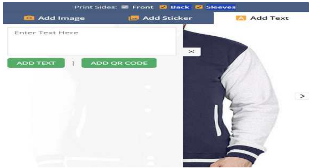
Fig 1.4 Display to apply text in any font style and type

The Focus on Customization: Spreadshirt offers a platform with design tools that let customers upload their own photos, pick from a wide range of typefaces, and utilize pre-made templates to create personalized t-shirts and other clothing. Strengths: Excellent for companies selling their own clothing line as well as individuals wishing to design unique items. offers a print-on-demand service free of charge up front. Excellent integration for online shop sales of personalized goods.