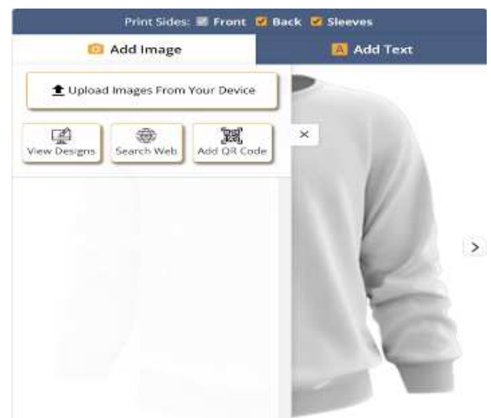
Fig 1.3 Show to apply different images and pattern types